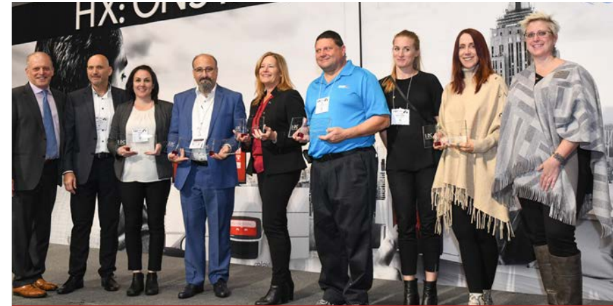
EDITORS' CHOICE AWARDS AND TECHpitch WINNERS AT HX 2018