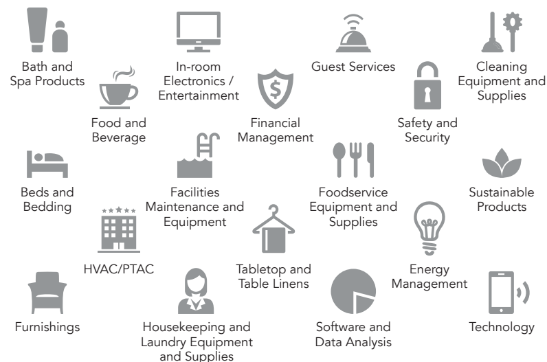
EXHIBIT SHOW FLOOR