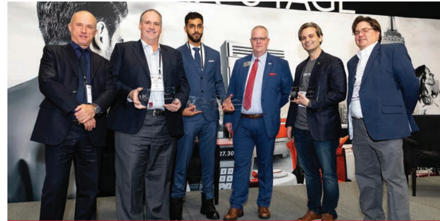
EDITORS' CHOICE AWARDS AND TECHpitch WINNERS AT HX 2019